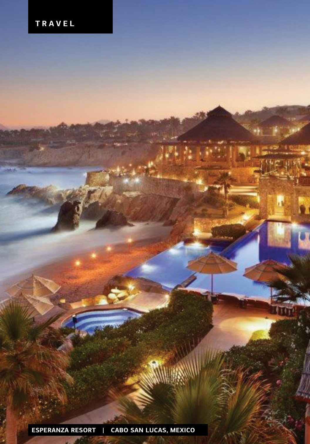
ESPERANZA RESORT | CABO SAN LUCAS, MEXICO